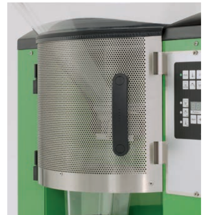
Optional fly protection screen

The fine-pored fly screen for the mixer prevents flies from getting into the feeding box. Steam that arises in the feeding box can easily escape because of the large size of the box and through the pores; condensation water is easily prevented this way.