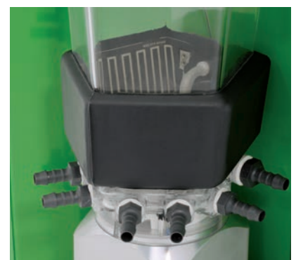
Mixer heating system available as an accessory

The boiler, which has a temperature sensor, an electronic heating regulator and a minimum temperature monitor, ensures that the feed always has the right temperature, and can be easily configured and checked.