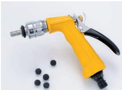
Hose cleaning pistol

The semi-automatic mixer cleaning system is efficient and easy to operate. At the press of a button you have water with a high temperature at your disposal. The open, tiltable feeding box is easily accessible and makes it possible to easily do a function check at any time. You can easily remove deposits in the suction hoses with the help of the hose cleaning pistol and also clean longer hoses with no trouble.